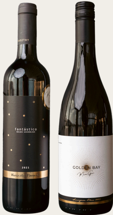
VARIETY WINE SET